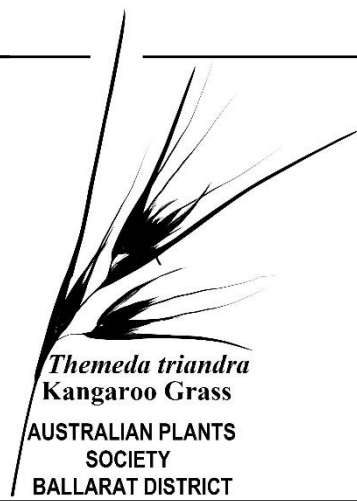
Themeda triandra Kangaroo Grass AUSTRALIAN PLANTS SOCIETY BALLARAT DISTRICT