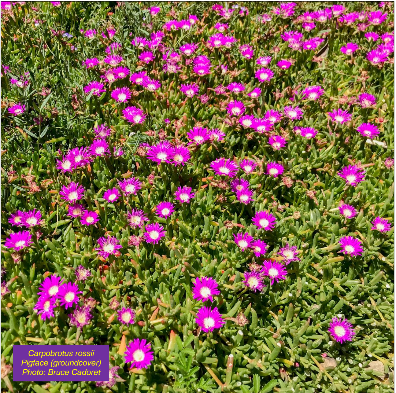
Carpobrotus rossii Pigface (groundcover)

Thanks to those who contributed reports or items for this issue